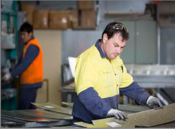
Duct & Sheet Metal Manufacturing