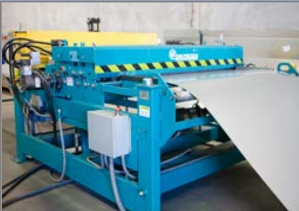
Coil Line Machine